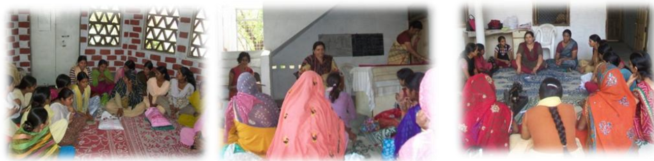
Glimpses of Charcha Mandal in-process

The sessions include array of relevant topics. Awareness on pre-marital issues, dowry, micro insurance, role of family counseling centre, child marriage, domestic violence, disaster management, positive and negative thinking, human rights, role of education etc. has already been imparted to past beneficiaries through these seminars.